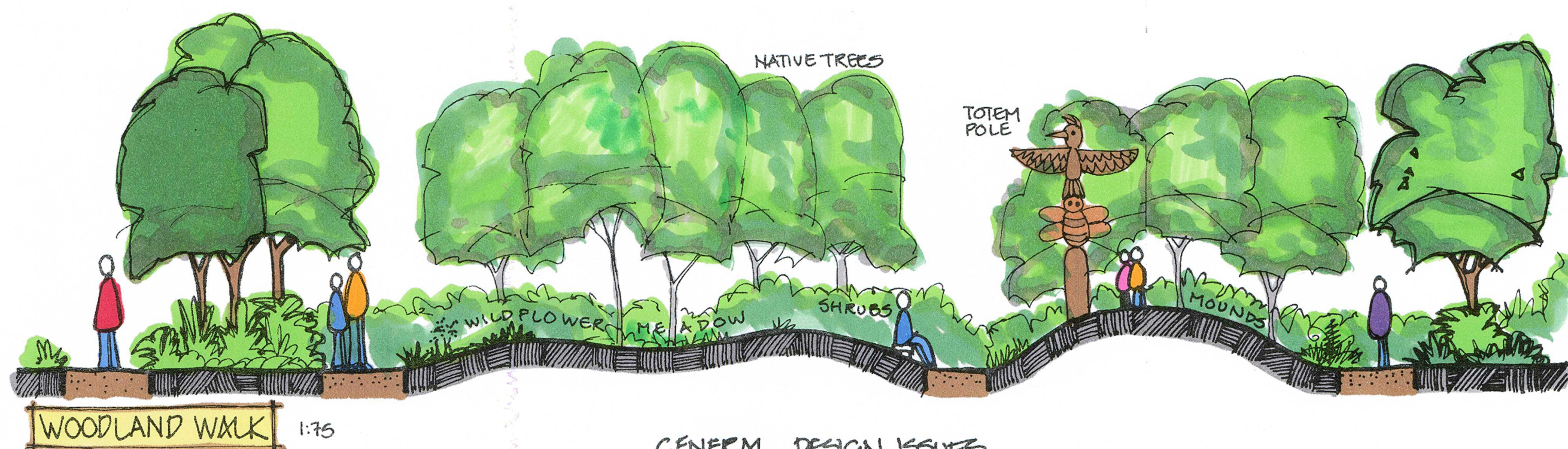
WOODLAND WALK 1:75

GRASS AREA FLEXIBLE EVENTS SPACE SHADE & SHELTER CONSIDERED